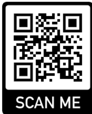
5. Recipes, articles and top tips to help you live healthy and happy