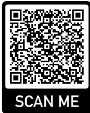
2. How NHS Digital and Public Health England collect and use information