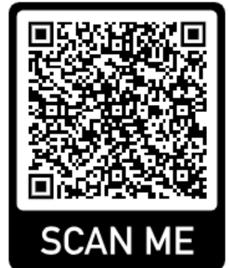
3. NCMP in Schools